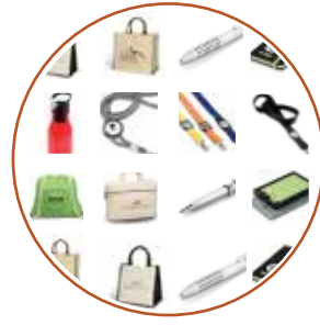
Corporate Gifts & Clothing