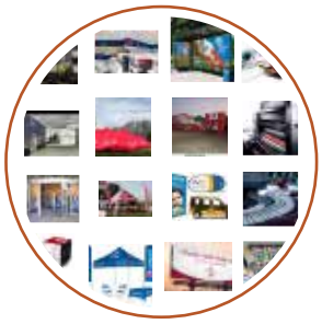
Indoor & Outdoor Branding